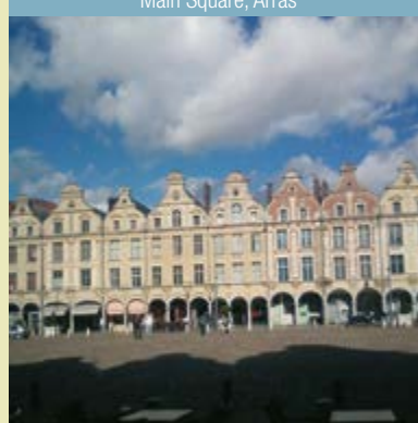
Main Square, Arras

Bike rental: Amiens Véloservice – www.buscyclette.fr Albert Tourist office – +33 (0)3 22 75 16 42