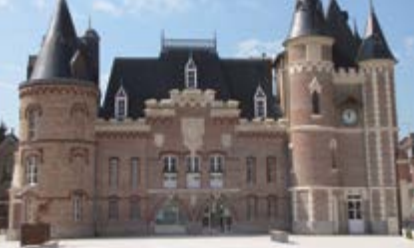
Town hall, Corbie