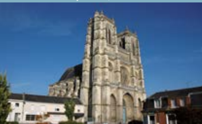
Abbey church, Corbie