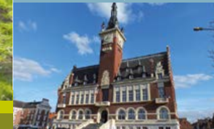
Town hall, Albert

Here you find in alphabetical order a selection of places to visit in the "Poppy Country" and the "Val de Somme" which are in the heart of the cycling route: